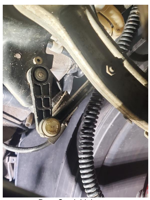
Rear Stock Link