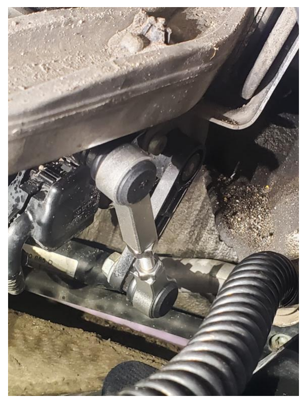
Front Adjustable Link