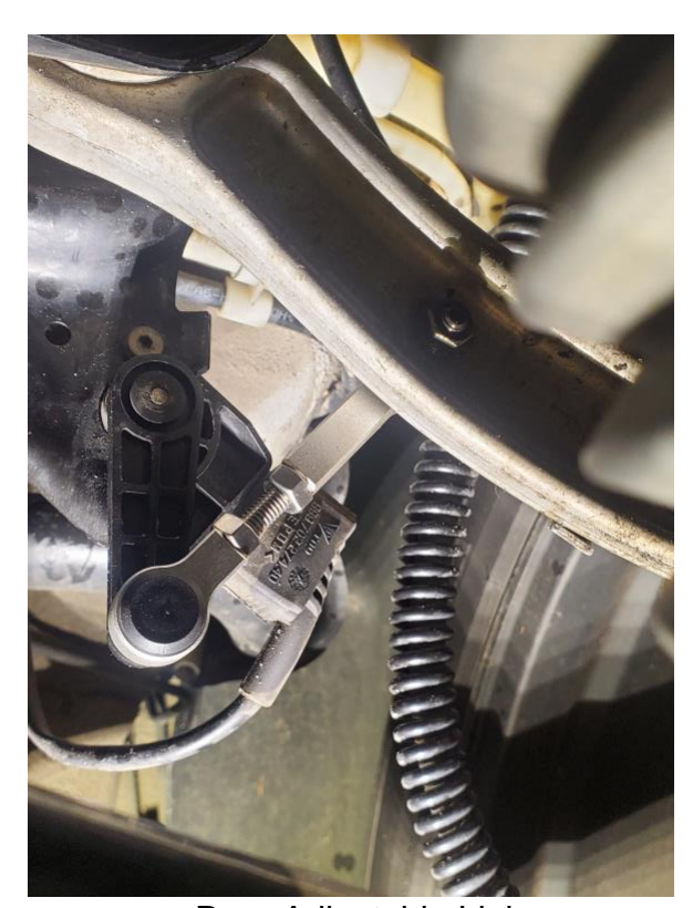
Rear Adjustable Link