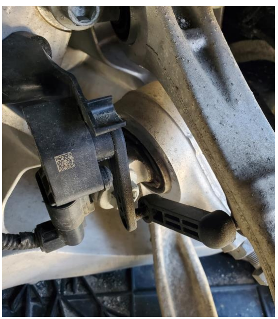
Rear Stock Link