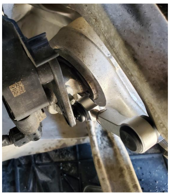
Adjustable Link Installed