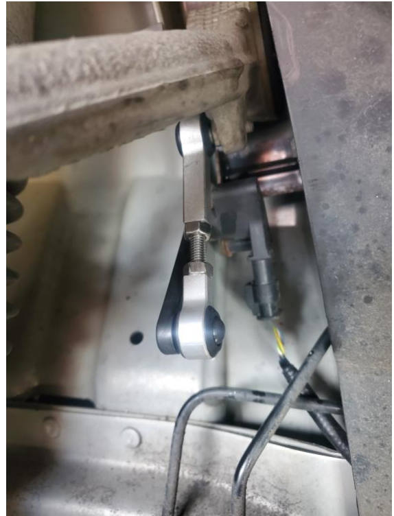
Adjustable Link Installed