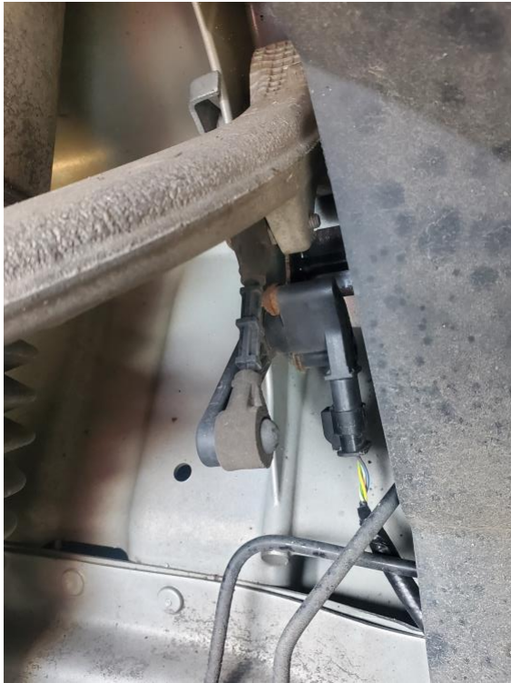
Front Stock Link