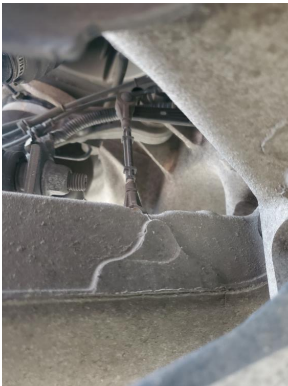
Rear Stock Link