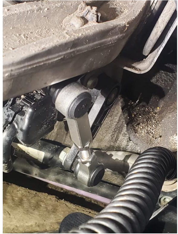
Front Adjustable Link