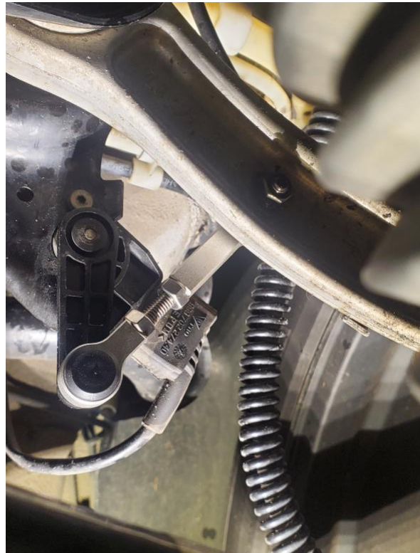
Rear Adjustable Link