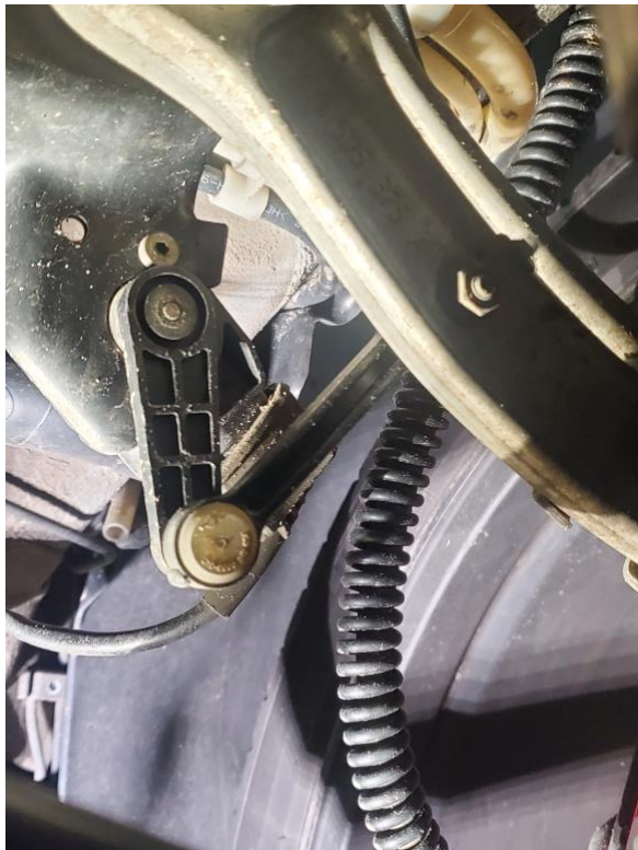
Rear Stock Link