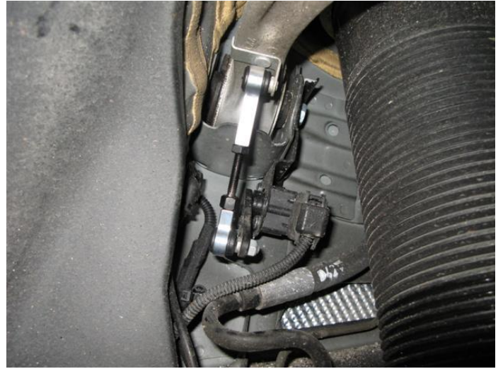
Adjustable Link Installed