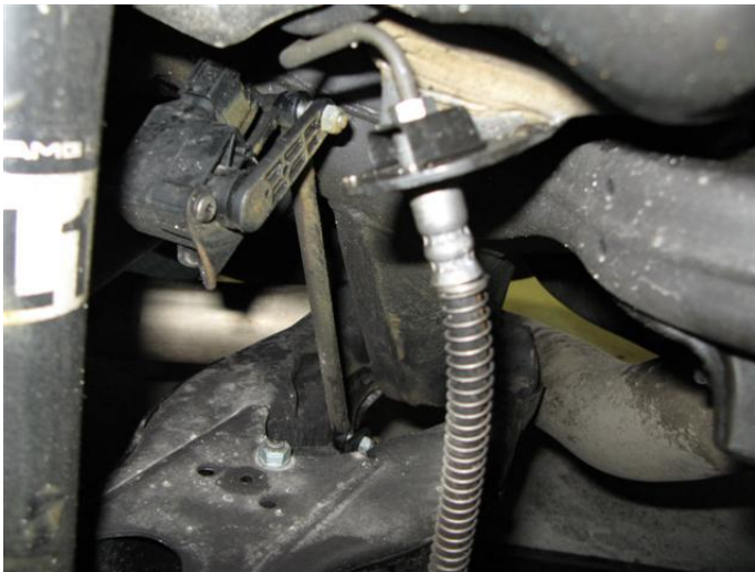
Rear Stock Link