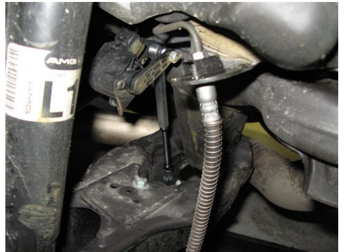
Adjustable Link Installed