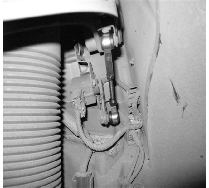
Front Adjustable Link installed