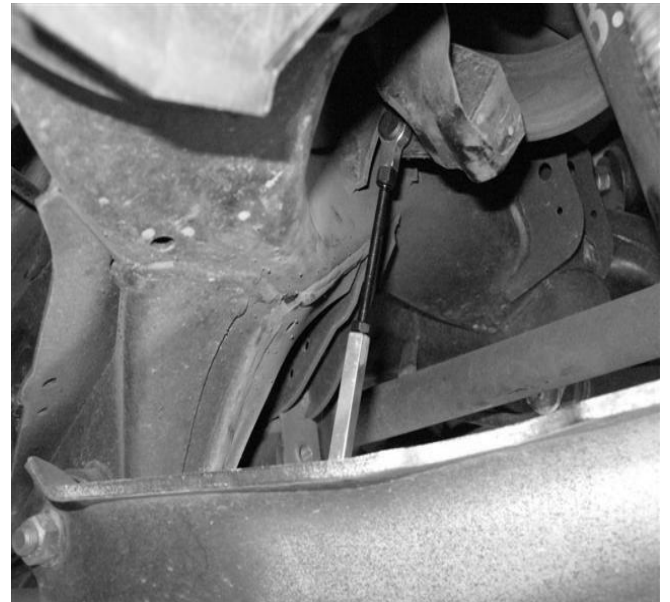
Rear Adjustable Link installed