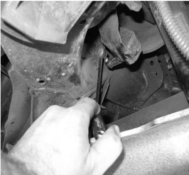
Rear Stock Link removal