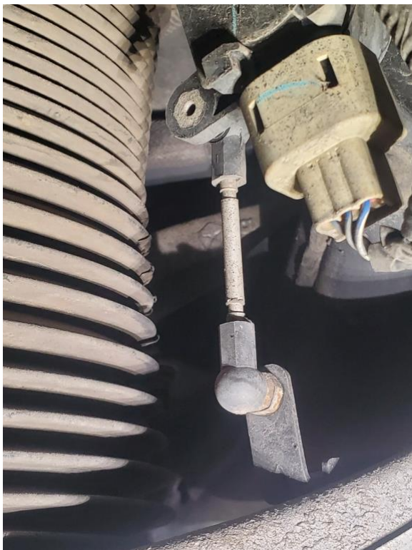
Rear Stock Link