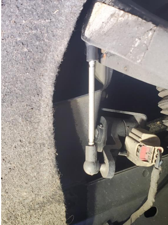
Front Stock Link