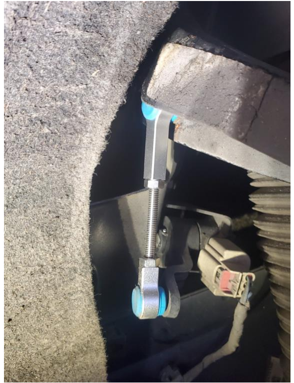
Adjustable Link Installed