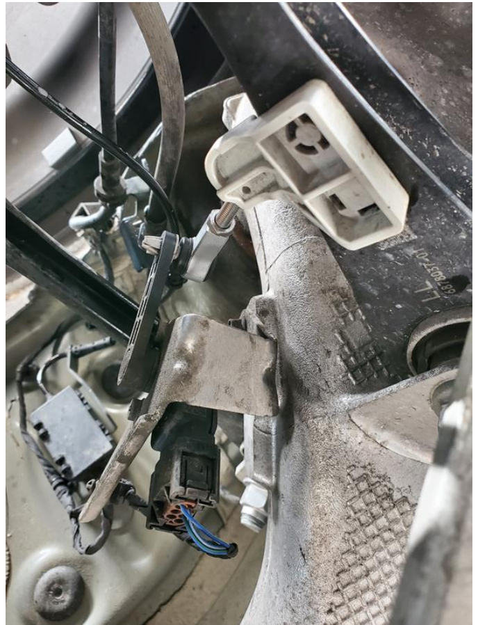
Adjustable Link Installed