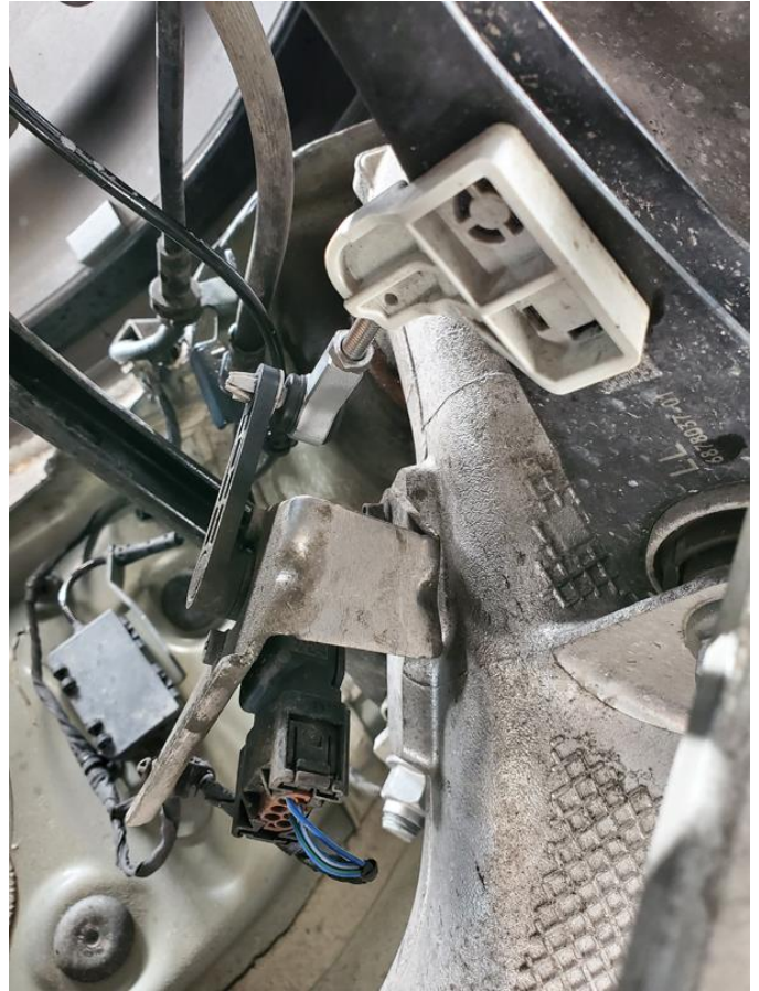
Adjustable Link Installed