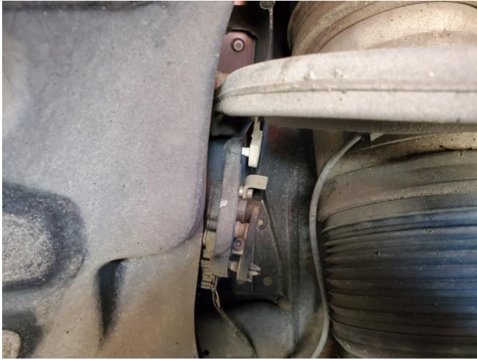
Front Stock Link