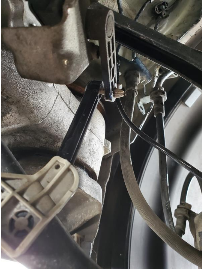
Rear Stock Link