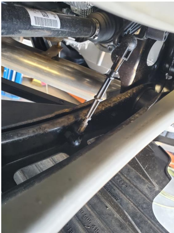
Rear Adjustable Link