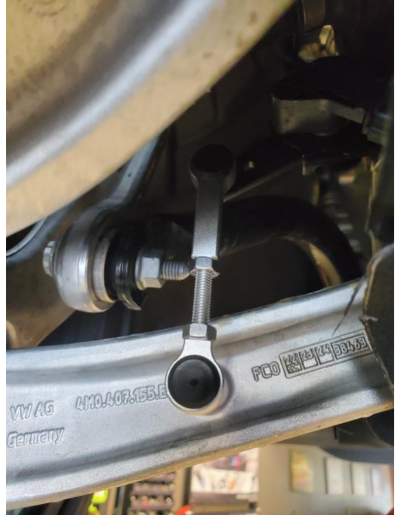
Adjustable Link Installed