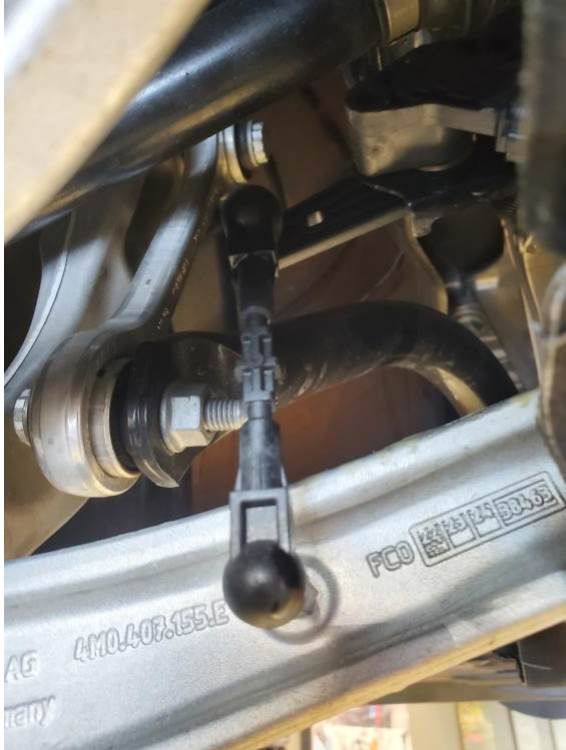
Front Stock Link