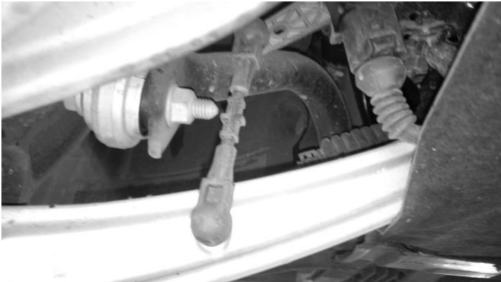
Front Stock Link