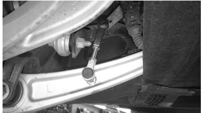
Adjustable Link installed