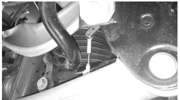
Adjustable Link installed