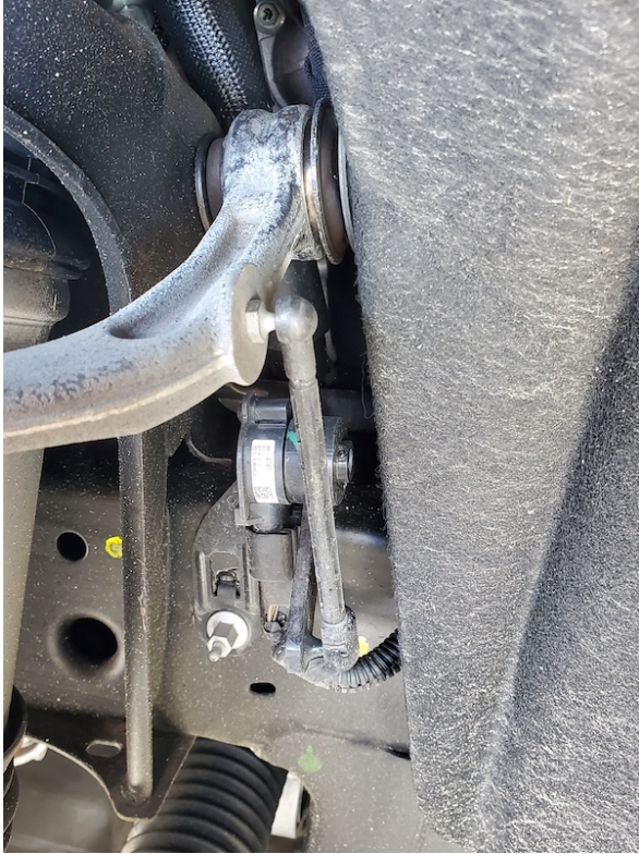
Front Stock Link