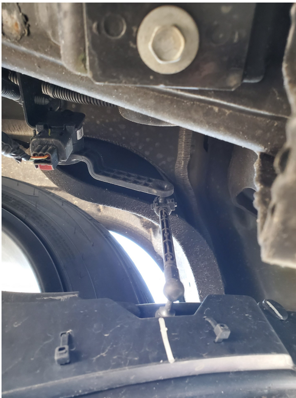
Rear Stock Link