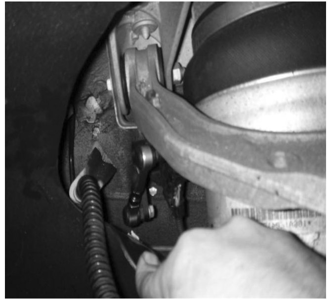
Adjustable Link installed