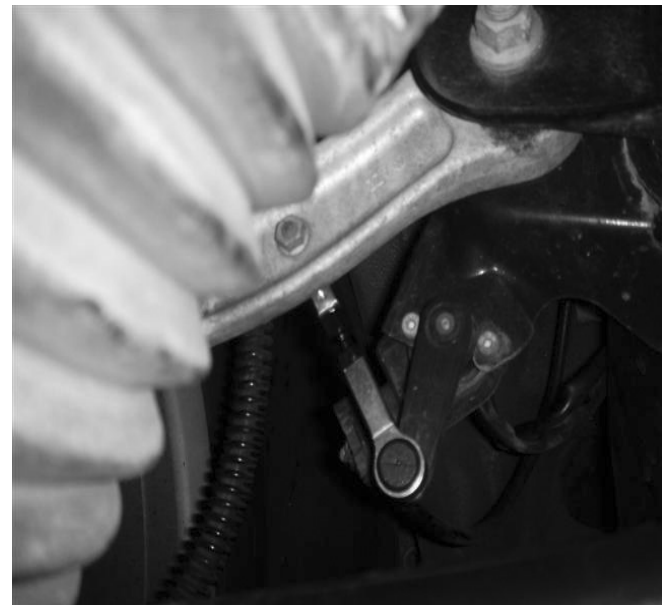
Adjustable Link installed