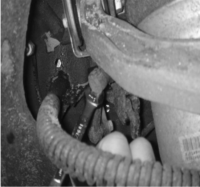
Front Stock Link removal