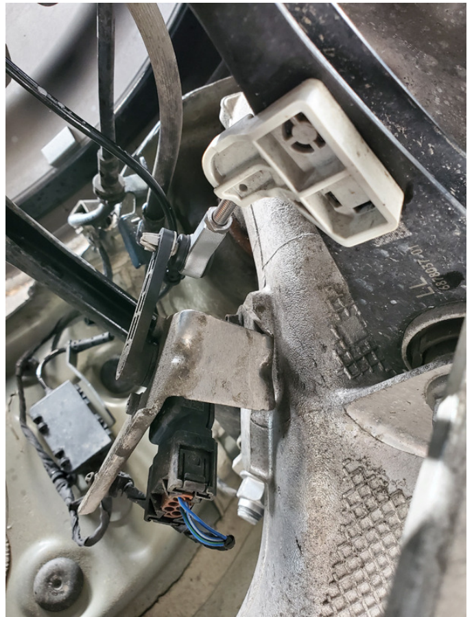
Rear Adjustable Link