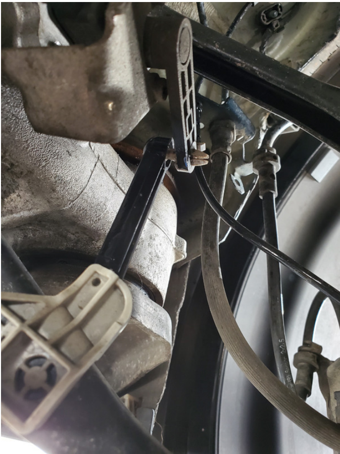
Rear Stock Link