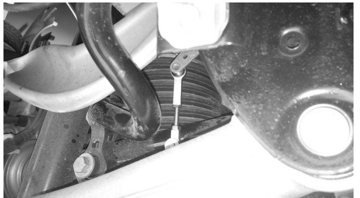
Adjustable Link installed