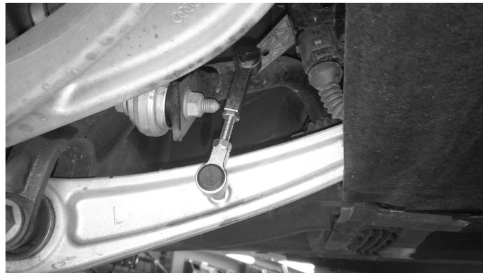
Adjustable Link installed