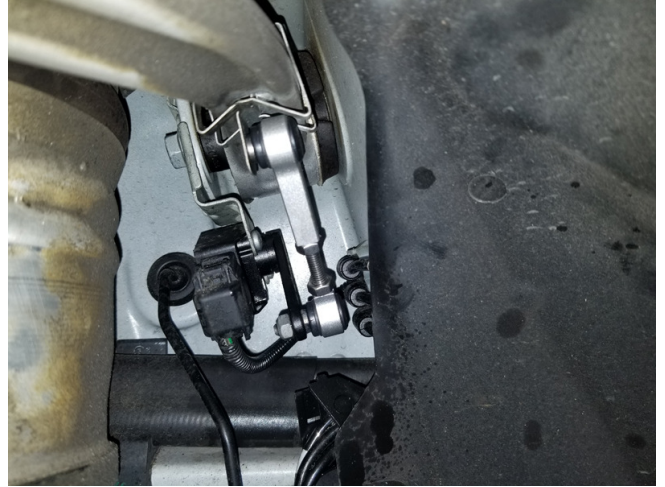
Front Adjustable Link