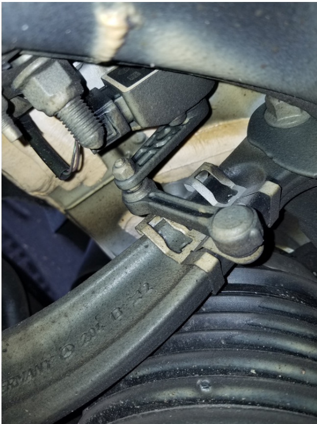
Rear Stock Link