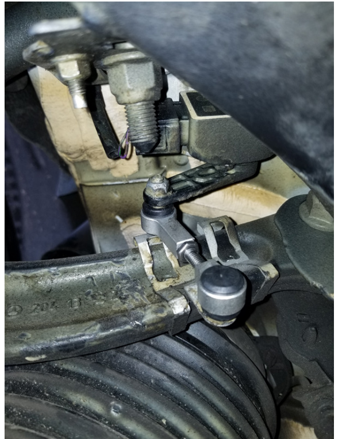
Rear Adjustable Link